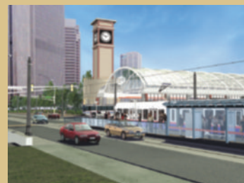
Transit centers with connectivity