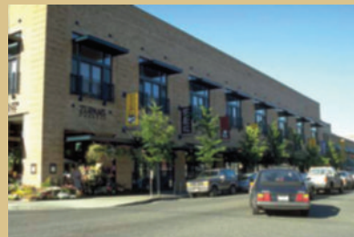
Diversity and mix of uses