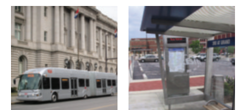
Cleveland, OH rapid transit vehicle

Real-time Passenger Information Reliable Transit Service