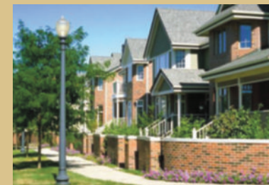
Compact and efficient land use